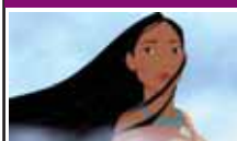
July 7: Pocahontas (North America)