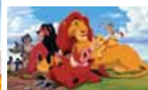
July 14: Lion King (Africa)