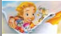
July 21: Rescuers Down Under (Australia)