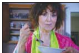
A scene from 'Cardinal Sins.'